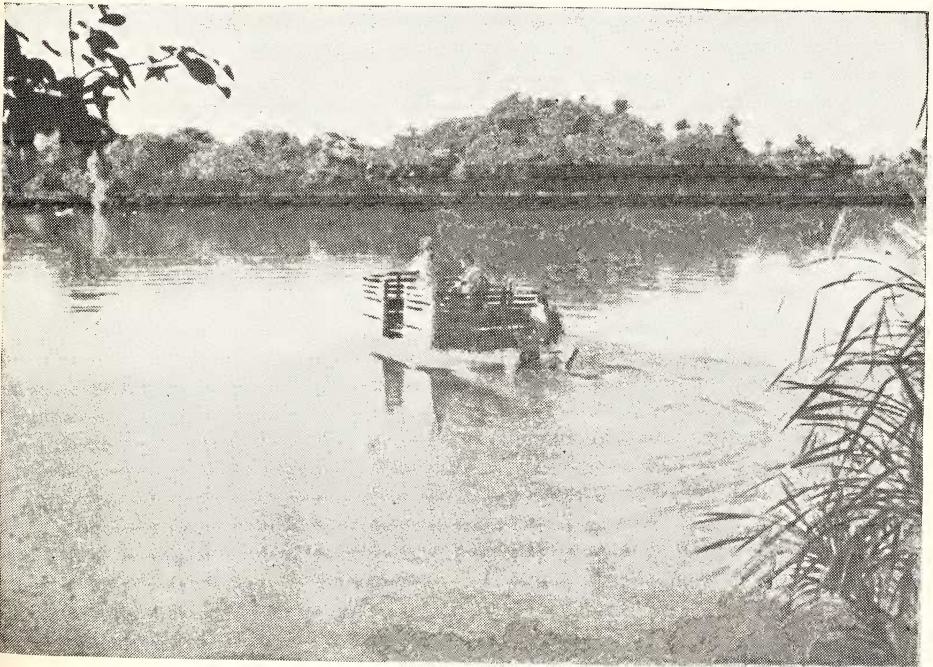
The Cauvery River, site of the Ranganathittu Bird Sanctuary. The double boat is provided for visitors by the Forest Department.